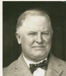
WILLIAM ALLEN WHITE