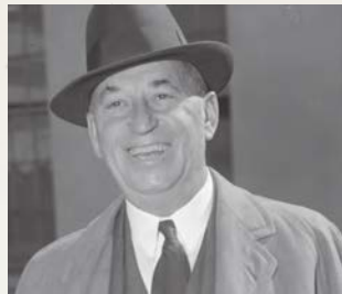
WALTER P CHRYSLER