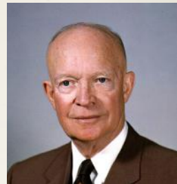
PRESIDENT DWIGHT D EISENHOWER