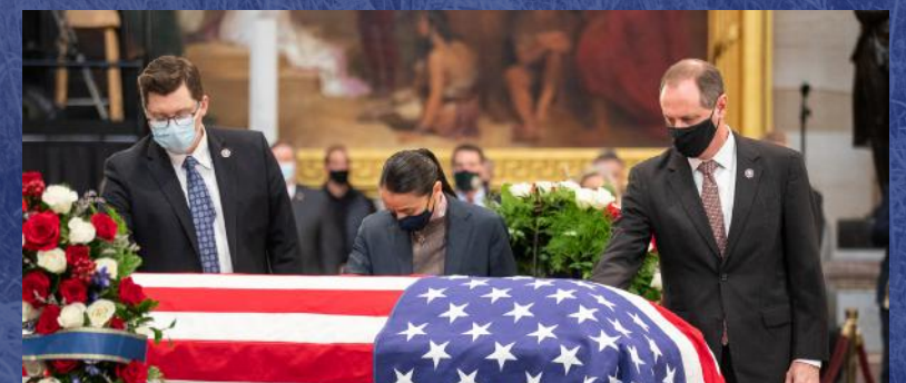
Rep. Mann, Rep. LaTurner (KS-02), and Rep. Davids (KS-03) paying respects to Sen. Dole during his Lying in State ceremony at the U.S. Capitol on Thursday, December 8, 2021.

Naming a post office after one of Kansas' favorite sons, in his hometown, is a small but meaningful way to pay tribute to this Kansas giant and American hero. I look forward to this bill's swift passage commemorating the life of Senator Dole.